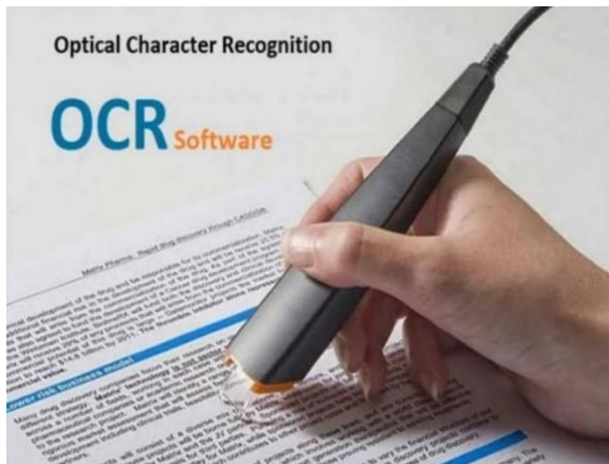
Fig 4 Optical Character Recognition (OCR)

OCR enables to convert previously prints text material into information. OCR requires a scanner and software .The basic process of OCR involves examining the test a document and translating the character into code that can be used for data processing .It is also referred to as text recognition OC R is using a scanner to process the physical form of a document .OCR software converts the document into two color or black and white version. The application of OCR is for automatic data entry, extraction processing and recognizing text such license plates with a camera or software.