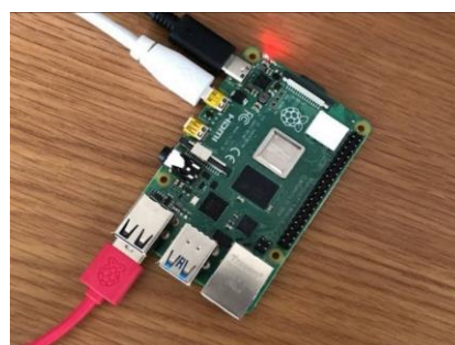
Fig 2 Raspberry pi

Here we are using synder python software to implement a program in order to store and access the data of the visitors and the hardware Raspberry pi is used. The Raspberry pi is a low cost, credit- card sized computer that plugs into a computer monitor or TV, and uses a standard keyboard and mouse. It is capable little device that enables people of all ages to explore computing, and to learn to program in languages. An SD card inserted into the slot on the board acts as the hard drive for the Raspberry pi. It is powered by USB and the video output can be hooked up to a traditional RCA TV set, a more modern monitor ,or even a TV using the HDMI port widely uses such as for weather monitoring because of its low cost, modularity and open design .