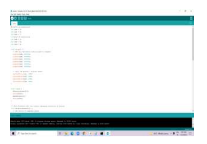
Fig 10.1: Arduino IDE