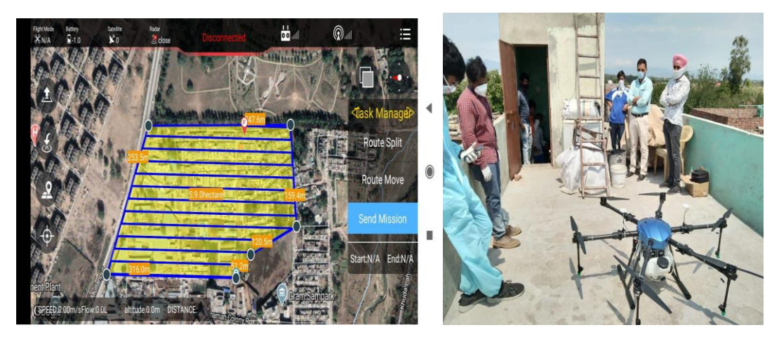
Figure 1 : Area covered by the drones

International Journal on Recent Researches in Science, Engineering and Technology, Vol.8, Issue 2, Feb. 2020. ISSN (Print) 2347-6729; ISSN (Online) 2348-3105