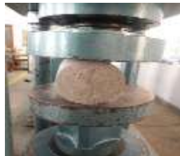
Fig 2. split tensile strength of concrete