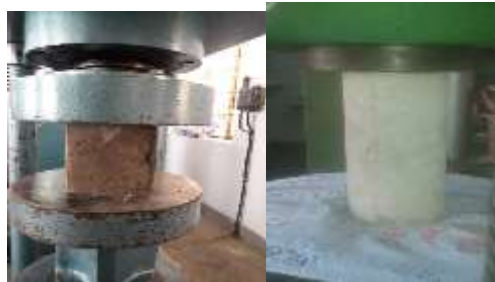
Fig 1. Compressive strength